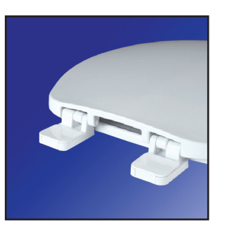
Factory-installed "living" hinge covers