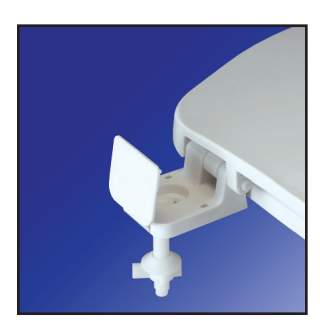
Corrosion proof, self-aligning hardware